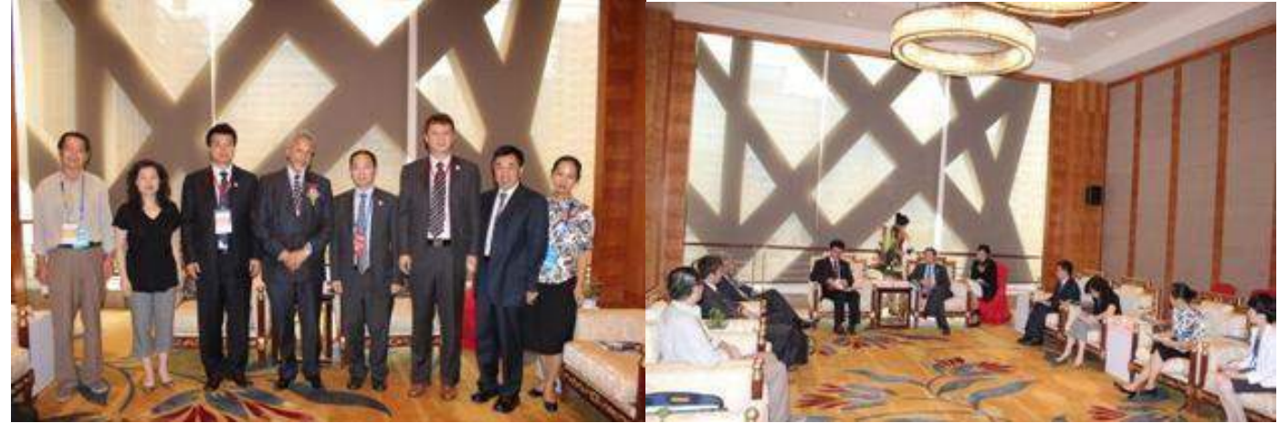
Council encourage overseas businesses,

Main Subject: Mutual communication; Sister Cities relationship; Education Exchange; Mutual Trade & Investment; New Zealand Culture, Infrastructure, Economy, etc. Investment opportunities in New Zealand and Auckland, How Auckland